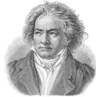
Ludwig van Beethoven. Geb. 16. Dez. 1770 in Bonn, gest. 26. März 1827 in Wien.